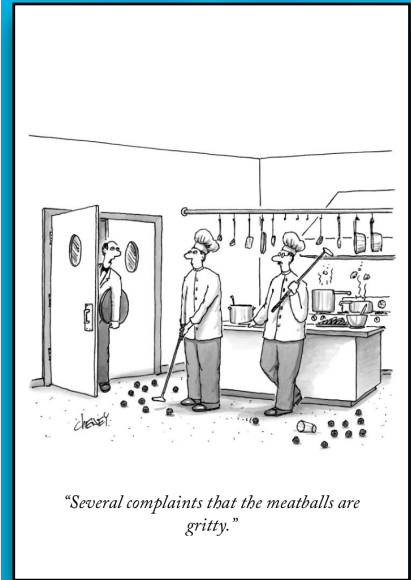
"Several complaints that the meatballs are gritty."