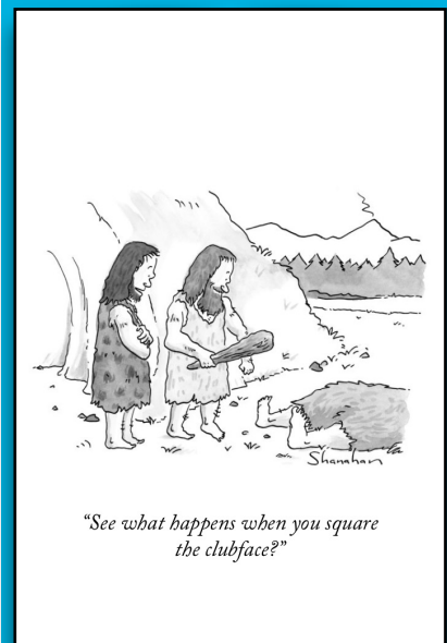
"See what happens when you square the clubface?"

All Members are invited to help contribute ideas and articles to our new club newsletter. Let us know what you would like to see, and the format to present it, paper, online, or email.