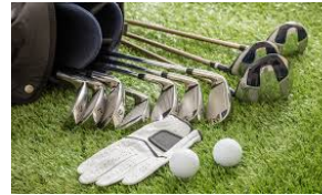
GOLF CHIP SHOTS CLUB TRADE, OR SELL COMING SOON