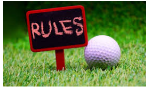
CLUB HISTORY And KP Information