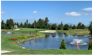
2026 GOLF SEASON & THE 80'S Tournaments, BBQ,