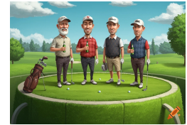
Executive Team and message